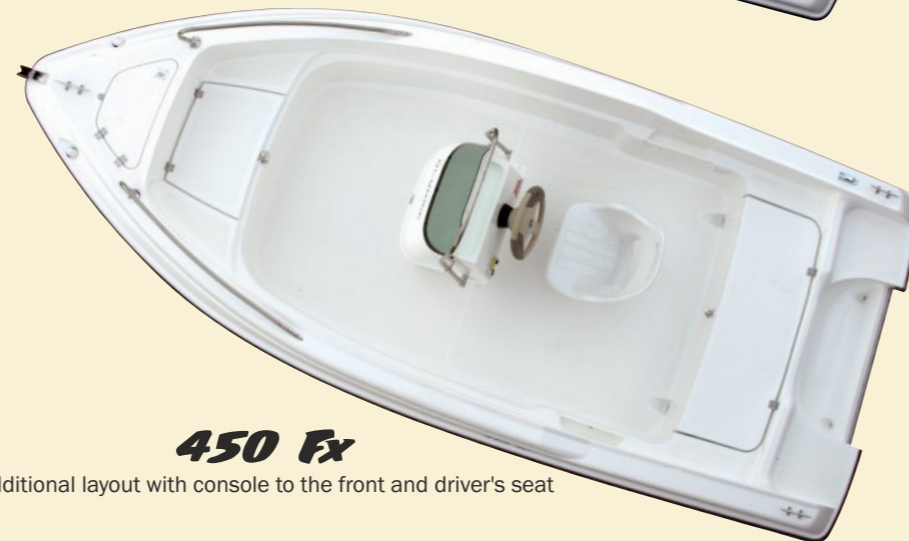
450 Fx Additional layout with console to the front and driver's seat