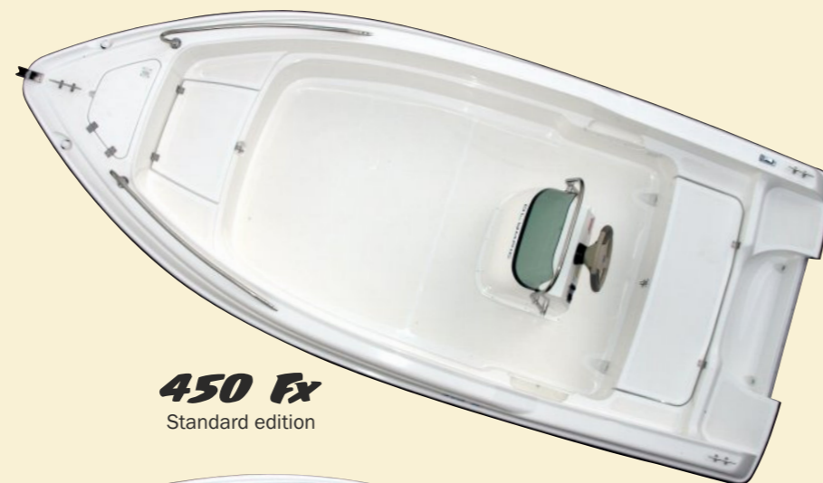
450 Fx Standard edition