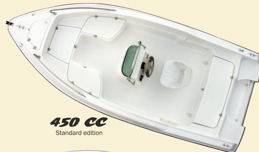
450 CC Standard edition