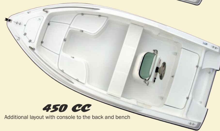
450 CC Additional layout with console to the back and bench